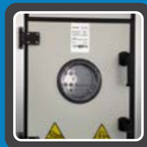
Inward Opening Pressure Doors