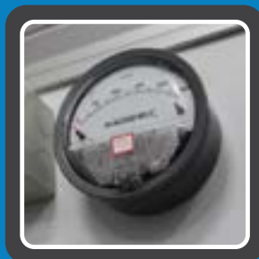
Magnehelic gauges and service lights