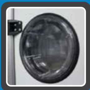
UV rated viewing portholes